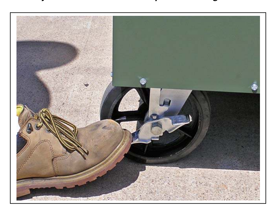
Photo showing how to manually engage and release the brake lever mounted on the storage cart swivel casters.

All System Components excluding the Ventilator Units are stored within the Cart. Ventilators are designed to store on top of the Cart Shelf. NOTE: Ventilators attached Bumper Feet will fit into polarized Base Tray Mounts secured to the top of the Storage Cart Shelf.