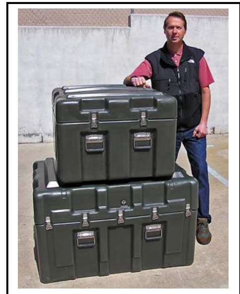
All Respiratory Protection equipment stores within these reusable containers.

WARNING: This Respiratory Protection System is not to be used in areas that are Immediately Hazardous to your Life or Health. Always ventilate Fuel Tank to safe acceptable levels before entering.