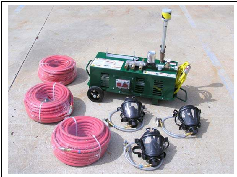
Respiratory Protection Equipment